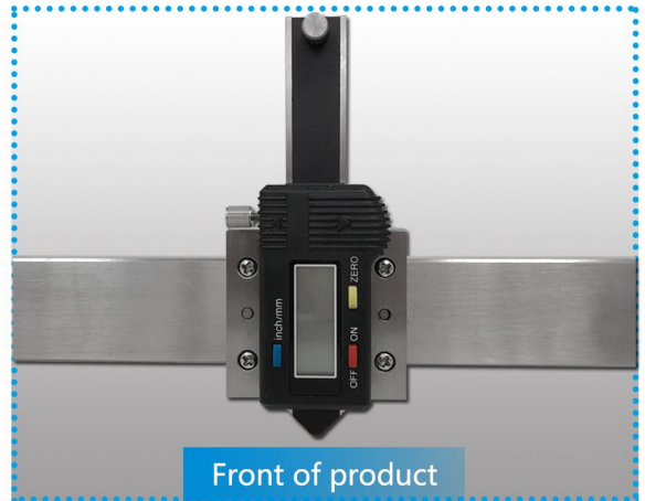
Front of product